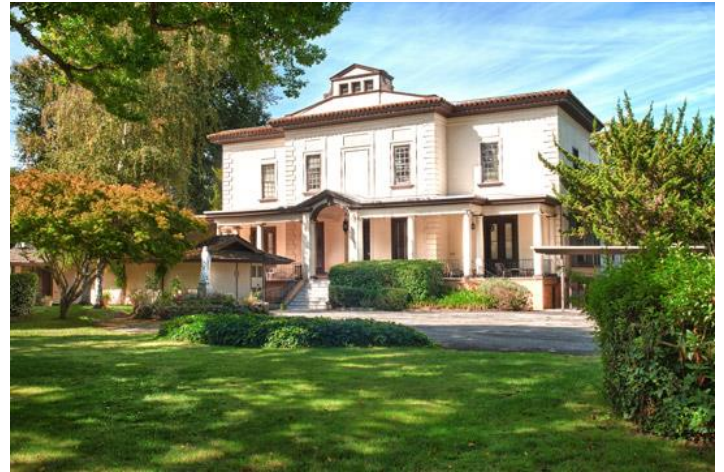
The Vallombrosa Center

The Weekend: Please arrive about 9:15 a.m. on Saturday. There will be three discussion periods, four fine meals, a wine and cheese reception and the showing of the iconic 1955 movie of East of Eden , directed by Elia Kazan and starring James Dean. The program will conclude after lunch on Sunday.